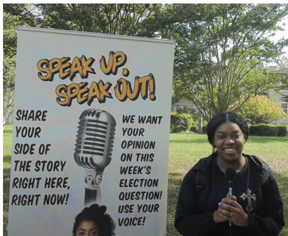
Goucher College Student taking part in “Speak Up, Speak Out”

How do you transform a college campus into a hub of democratic engagement? It starts with bold ideas, creative initiatives, and dedicated leaders. Through our inaugural Back to School for Democracy Collaborative Fellowship, supported by the Mellon Foundation and The Eugene M. Lang Foundation, this fall we awarded eight mini-grants to empower campus communities to address civic and social justice challenges.