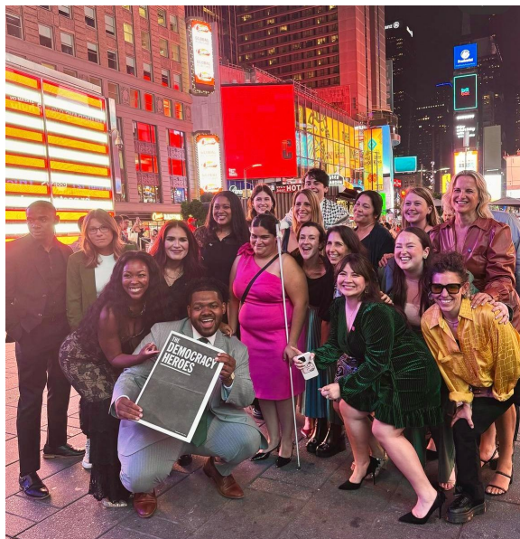
A group photo of the Democracy Heroes in Times Square, where their faces were featured on a Jumbotron.